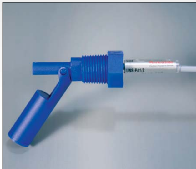
Level switch made of nylon or polypropylene for side mounting