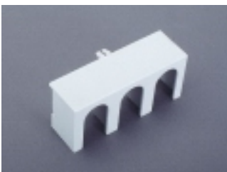
79811 cover for connecting space for 33197, 33198, 33199, 33200