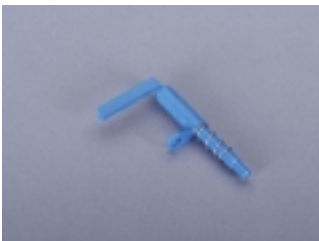
03849 lid interlock for fuse switch-disconnector size 00