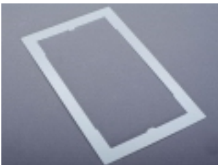
78893 trim frame 130 x 210, not for 33221, 33222