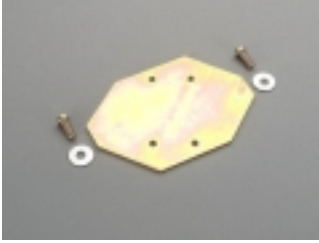
33193 rapid mounting set busbar distance 125 mm or 150 mm