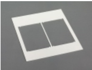
78105 double trim frame 232 x 210, not for 33221, 33222