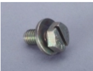
30894 screw-type connection M 8 with spring washer