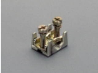
33224 prism terminal for fuse switch-disconnector 16-70 mm 2 , Cu and Al