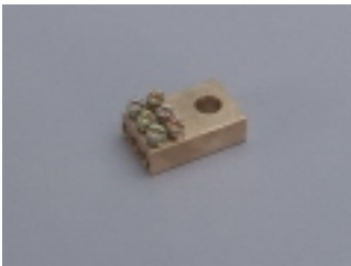
01182 tunnel terminal 3 x 1.5 - 16 mm 2