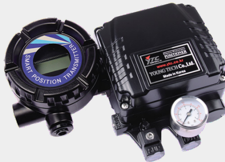
YT-1000L + SPTM & LCD